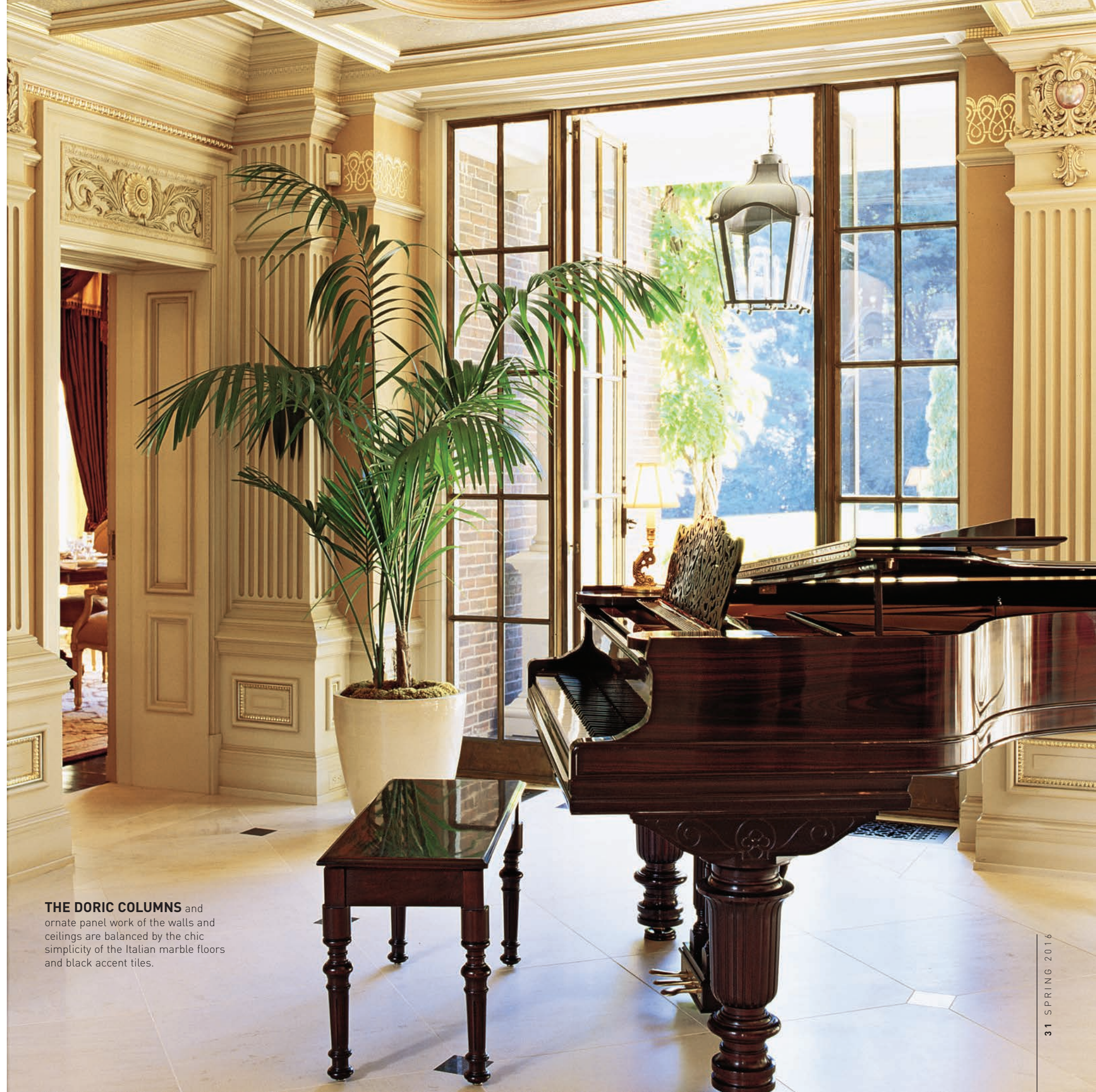
THE DORIC COLUMNS and ornate panel work of the walls and ceilings are balanced by the chic simplicity of the Italian marble floors and black accent tiles.

The design firm oversaw a stunning collection of antique and reproduced furniture, lighting, fireplace